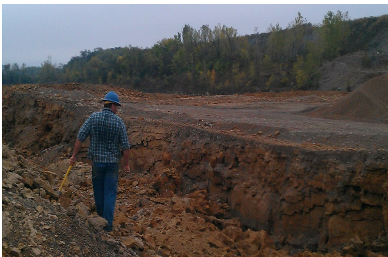
FM member looking for calcite vugs at Anderson, Indiana.