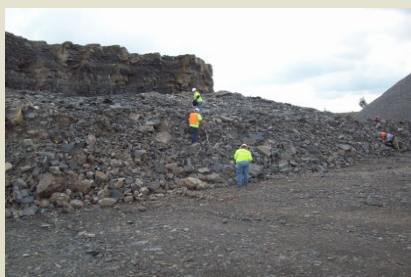
FM Members at a recent Duff Quarry field trip.

Newsletter published bi-monthly in January, March, May, July, September and November. Please submit all information for publication in the newsletter by the 15 th of the previous month.