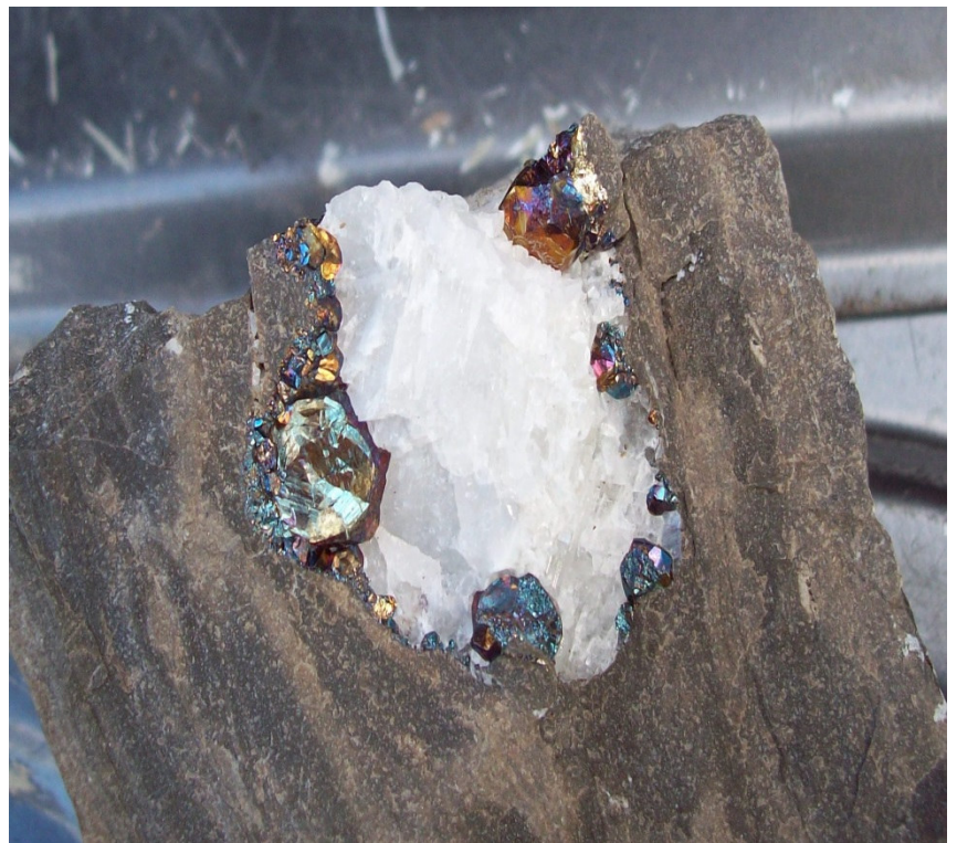
At the right 2 nice samples from the Duff Quarry Trip