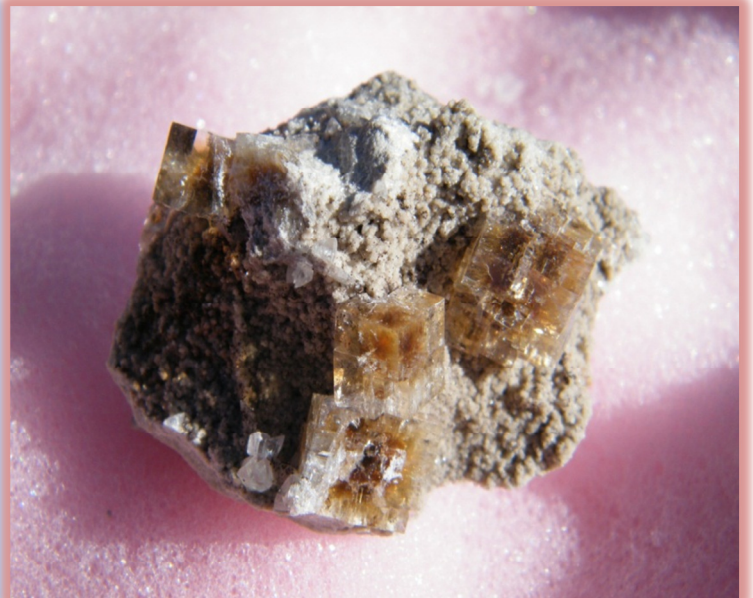
Fluorite collected last fall at Genoa - Scott Sadlocha