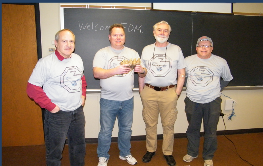
“FM members showing off their new T-shirts”