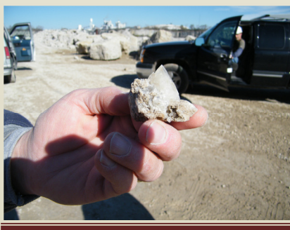
A nice calcite find from a recent collection.

Newsletter published bi-monthly in January, March, May, July, September and November. Please submit all information for publication in the newsletter by the 15 th of the previous month.