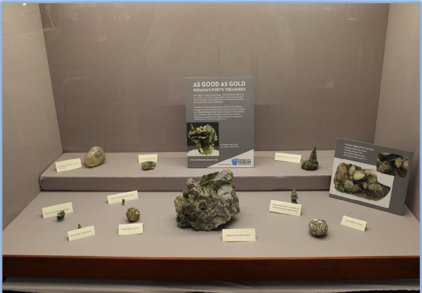
The Indiana case at the Tucson Show