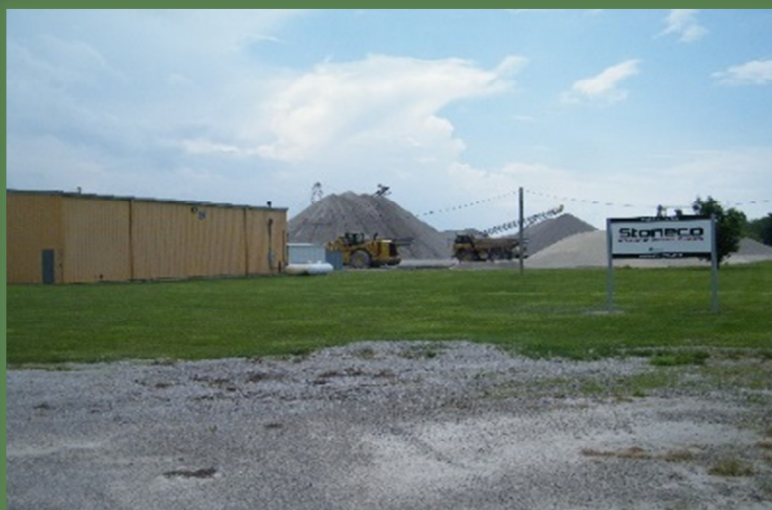
Auglaize Field Trip Report - Page 7