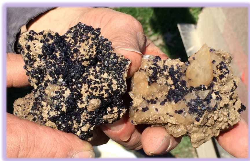
Dave Esch proudly showing off two nice specimens pulled from the Royal vein

Our hosts at the quarry were very friendly and allowed us to remain in the quarry for a few extra hours. After a pleasant 15 minute drive down into the quarry while watching bald eagles fly overhead, the group was allowed to spread out on the quarry floor to the piles located there. Mike Royal took out his patented fluorite tracking device and quickly honed in on a juicy vein running through the quarry floor. This vein produced some very nice specimens of dark purple fluorite cubes with calcite.