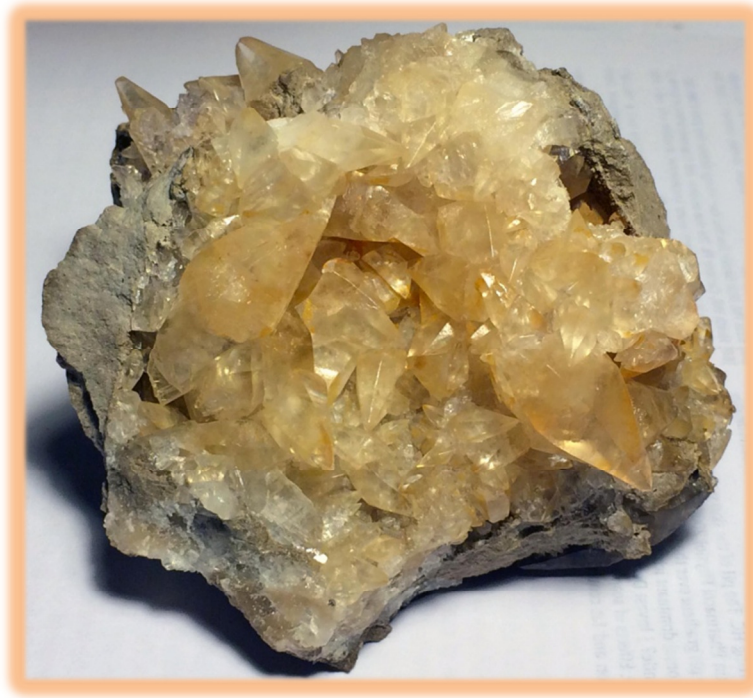
One of Randy's fossil sponges with calcite crystals

A good time was had by all on this trip with many more specimens being found. Let's hope we do as well at the upcoming trips at Auglaize and Pipe Creek Junior! Happy hunting!