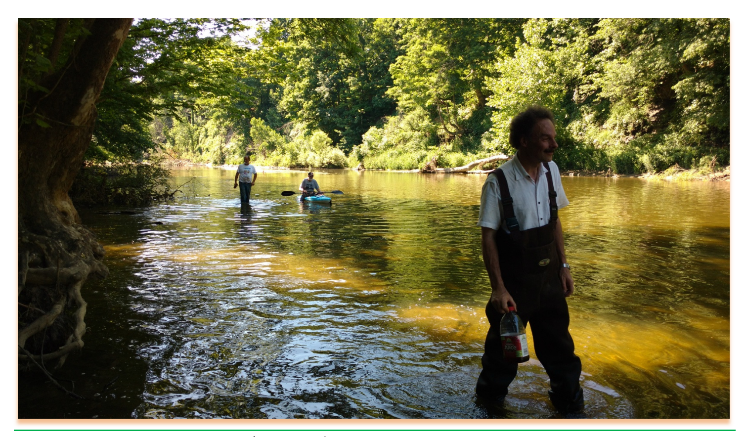
Some FM's enjoying the water at a recent Huron River Trip