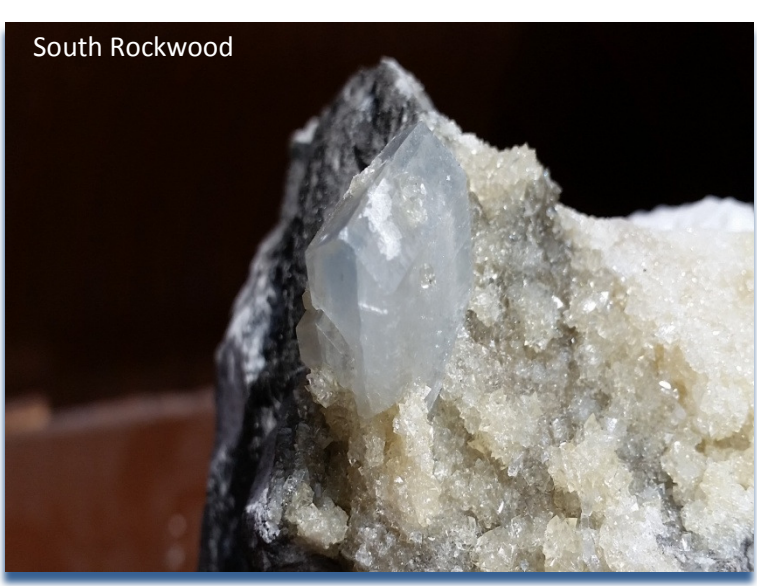
A celestine specimen collected by the editor