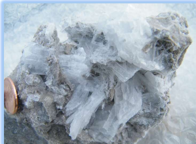
Celestite