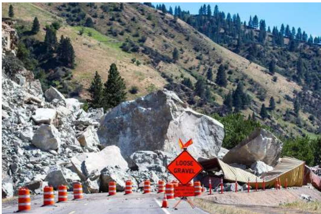
Collecting of loose gravel is permitted.