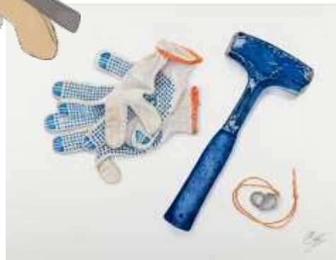
Watercolor by Ksenia Levterova

Rock and Mineral Shows, Clubs, Rock Shops, Mineral Museums can be found via www.rockandmineralshows.com and https://xpopress.com/show/exposearch