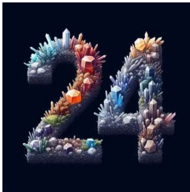
DALL-E 3 generated art (Maertens)

Did you visit Tucson 2024 or another show? Share your report with the members.